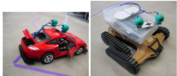
Figure 1: Jet (Left) and Slug (Right)

Copyright © 2006, American Association for Artificial Intelligence (www.aaai.org). All rights reserved.