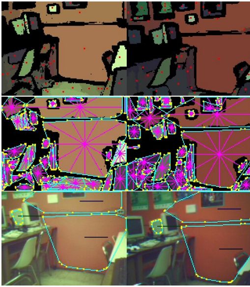
Figure 2: Segmented regions (top), convex hulls and signature lines plotted (middle), matched regions (bottom).