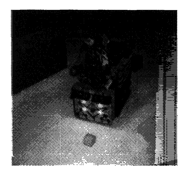
Figure 2: Winney the Brick examining a block.

Planning was an important part of the robot's task. This is a point of emphasis for our robot competition. The competition is designed to reward robots that exhibit intelligence within a specified domain. By incorporating planning into the overall function of the robot and an integral part of the competition, a team of students cannot implement an ad hoc design that will do well in the competition.