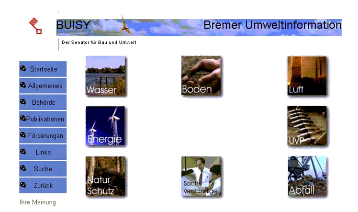
Abbildung 1: The main areas of the BUISY system

the publication of approved information on the internet.