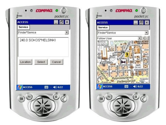
Figure 4. (a) The Available Hotels Panel (left) (b) The View Hotel Location Panel (right)

the payment. Upon confirming the payment an appropriate transaction occurs (e.g. a VISA transaction), and a booking number is generated. This number is displayed to Greg, and stored in his "My Bookings" container.