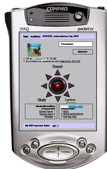
Figure 3: Mobile MIR application

Several prototypical systems combining different external web services and internal music processing agents have been realized in our previous work [22,23].