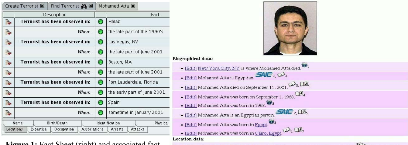
Figure 1: Fact Sheet (right) and associated fact entry/edit page (above) for Mohamed Atta.

Currently, the Cyc Analytical Environment (CAE) includes both a mechanism for manually adding new facts about an entity to the Cyc KB, as well as Fact Sheets (HTML documents) that display the accumulated knowledge about any particular entity (e.g. see Figure 1).