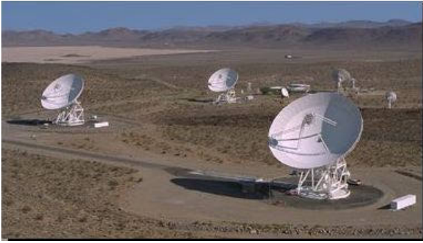
Figure 5 34m BWG Antennas at Goldstone

schedule for execution and provides the means for automated rescheduling and/or manual schedule editing in the event of changes. The Configuration Engine is then responsible for retrieving all the necessary data needed for station operations. Next, the Script Generator (ASPEN) generates the necessary command sequence to perform the track. Finally, a Station Monitor and Control process executes the generated script and records relevant monitor data generated during the track.