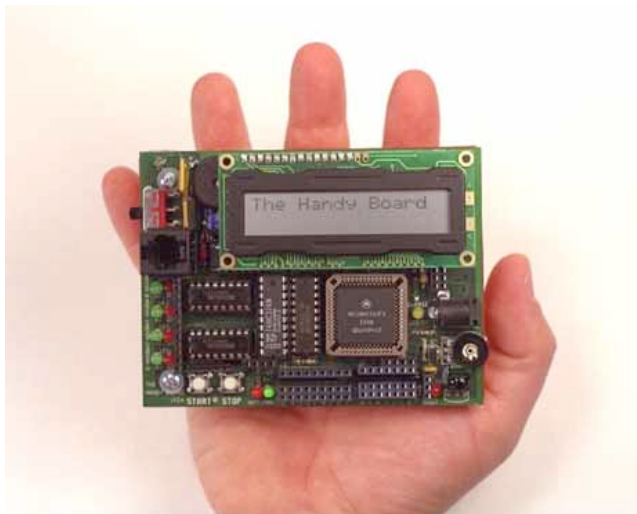
Figure 1: The Handy Board

The Handy Board is a palm-sized robot control board that was developed in the early 1990s for use with the undergraduate “6.270” LEGO Robot Design Competition at the Massachusetts Institute of Technology (MIT). The full hardware design (including PCB artwork) and a version of its specialized “Interactive C” software were released to the public with an open-source license in 1995. The design is now in widespread use worldwide, in universities, colleges, and secondary schools. Here, we describe the qualities that made the Handy Board design successful, and present goals and initial plans for a next-generation design. This paper is meant as a catalyst for conversation; we welcome input regarding our work plans.