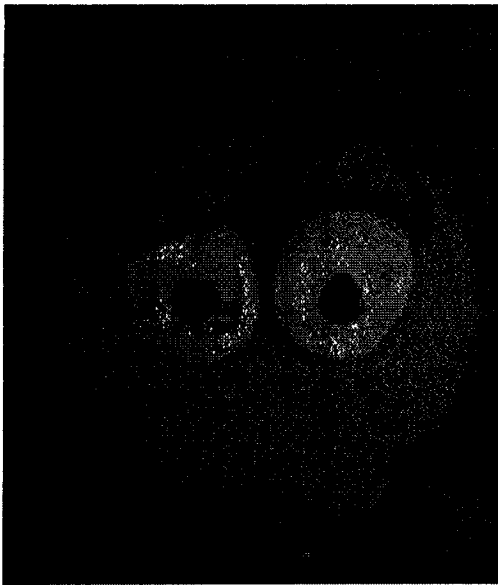
Figure 1: Prototype RoboWoggle

based on Marvin Green's BOTBoard, modified to provide an additional 32K of memory. It can control 4 servomotors, and has a number of analog and digital inputs, and digital outputs.