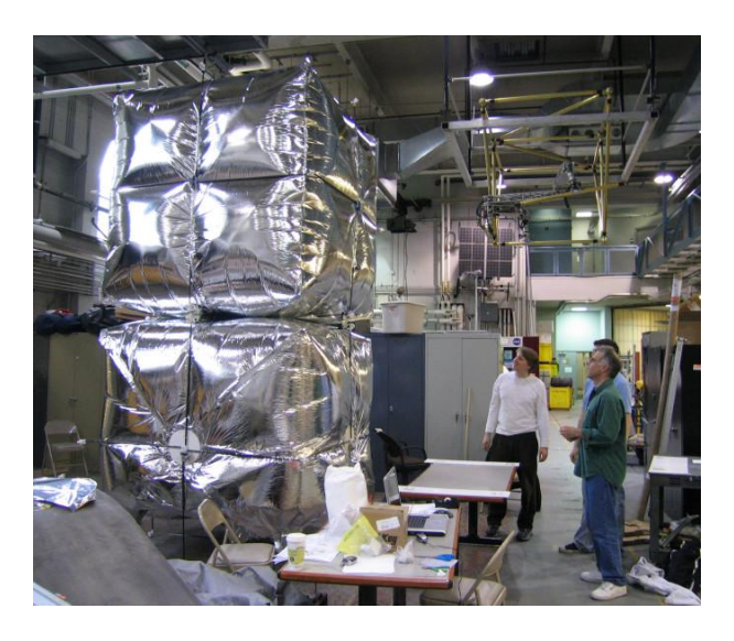
Figure 1: Giant helium filled catoms.

Copyright © 2006-7, American Association for Artificial Intelli-