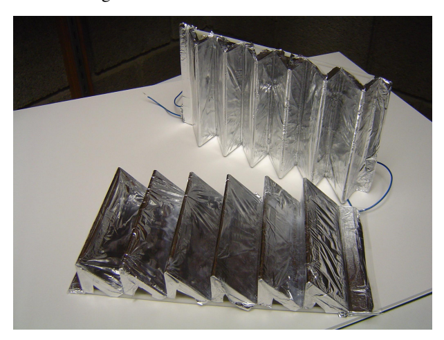
Figure 2: Corrugated flaps

In our experiments we found that when the flaps were charged, even when a good seal was created between the flaps, that the flaps would peel away from each other. In