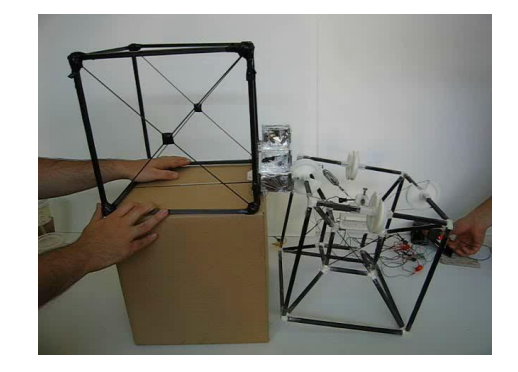
Figure 4: Catoms latching

The robots move around each other in a three step process. First, each robot moves the proper flap out from the face. If the robots are arranged as in Figure 3a, then each flap must move 45^{\circ} . If they are aligned with each other, then each flap is rotated 90^{\circ} . When the flaps come into contact with each other each robot excites the electrodes attached to its flap. This causes the robots to adhere to each other. Then, in the final step, the robots move the flaps back to their original position (see Figure 3b). The robot which is not bound to anything else will move into the desired position. In our actual demo, only the fixed robot moved its flap.