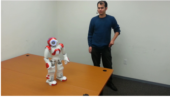
Figure 2: Picture of an interaction scenario in which the robot rejects a command to “walk forward,” as it reasons that it may be harmed from such an action.

appropriate for the robot to reject a command it is perfectly capable of carrying out 1 .