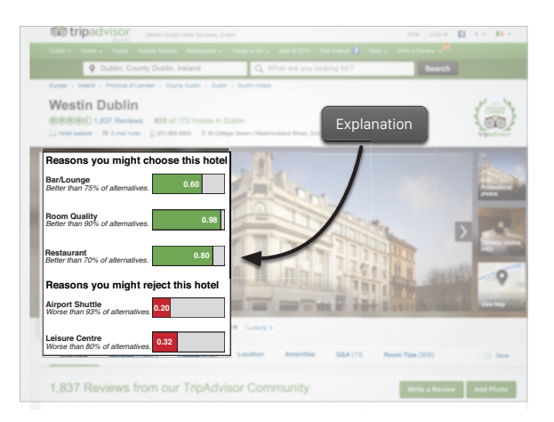
Figure 2: An example explanation showing pros and cons that matter to the target user along with sentiment indicators (horizontal bars) and information about how this item fares with respect to alternatives.

explanatory text that highlights how the hotel compares to other relevant items called a reference set (such as alternative recommendations as in this example) in terms of this feature.