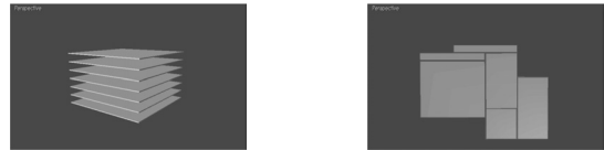
Figure 1: The image of quasi-3D space and a target figure

A rectangle R is a nonempty set of atomic rectangles r_1, \dots, r_n , each pair of which can share only their boundaries. A rectangle either hides all or no part of an atomic rectangle. That is, a rectangle does not hide a subpart of an atomic rectangle.