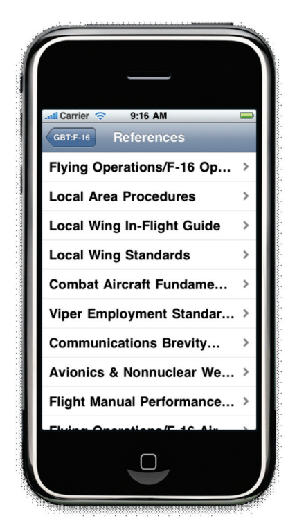
Figure 4: List of PDF references for F-16 pilots

initial version of GBT F-16 supports five different training games: Radar, Master Question File, Visual Recognition, Communications Format, and Symbol Recognition.