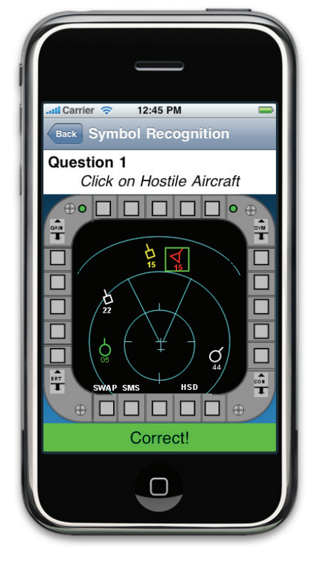
Figure 8: Symbol recognition game where the student has selected the correct symbol

in the simulated display as fast as they can. A sample question from the symbol recognition game is shown in Figure 8.