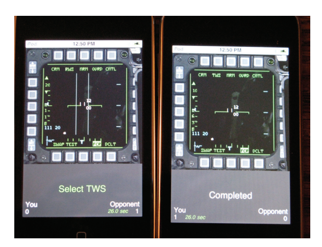
Figure 2: Be the first to reach the given radar settings on the prototype in head-to-head competition