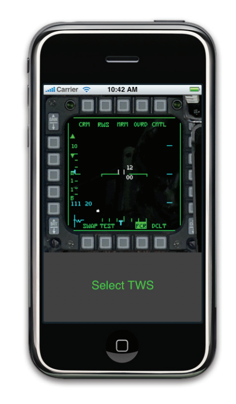
Figure 1: iPod prototype for Radar buttonology, with the hint Select TWS displayed

the radar system. In either single- or multi- player mode, the student is asked to configure the radar to a given set of settings. In multiplayer, the goal is to get the radar configured first, and you can see your score relative to your opponent as shown in Figure 2. This prototype uses a simple form of hinting as a placeholder for a more powerful intelligent tutoring system, where the next step is given to the student below the radar screen if the student seems to be stuck.