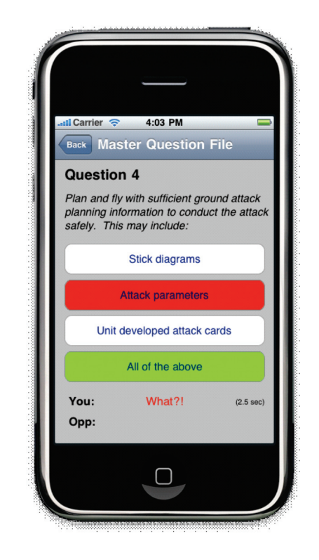
Figure 5: Getting a MQF multiple choice question wrong (red) with the correct answer shown (green)

Master Question File. The Master Question File (MQF) game is aimed at allowing students to practice for their MQF tests. It is based on a standard quiz format, presenting a question through text, pictures, video, or audio (or some combination) followed by multiple-choice answers. The prototype contains a number of sample MQF questions as shown in Figure 5, where the user has selected an incorrect answer. An example question is: A 2000-foot acceleration check speed will be computed anytime computed takeoff roll exceeds ( ) feet. When computed takeoff distance versus computed takeoff distance to evaluate aircraft performance. a.1500 b. 2000 c. 2500 d. 3000 Answer: c