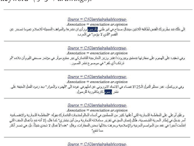
Annotation = enonciation anopinion ویری محمد کورنی، أن منظمه الشداب مما من أجل نهصه استدمیات، التي براسها نحاول استثمار الجنل الذي أثارته أزمه الصحح Figure 3: screenshot of the results of the annotation

The process pipeline starts with segmentation and the annotation process is then called, the results are directly displayed in a base of annotated segments, according to their classification in the semantic map. The user can then navigate between the base and the original sources, or carry out a search by keywords on various spaces defined by the segmentation or by the places of the markers in segments, i.e. the content of quotation, the place of speaker, the theme of quotation...In figure 3 , the base of annotations contains quotations annotated in Arabic, the user filters only those having the annotation of "opinion" of speaker, on which he carries out a request with the keyword "cue" / drawings).