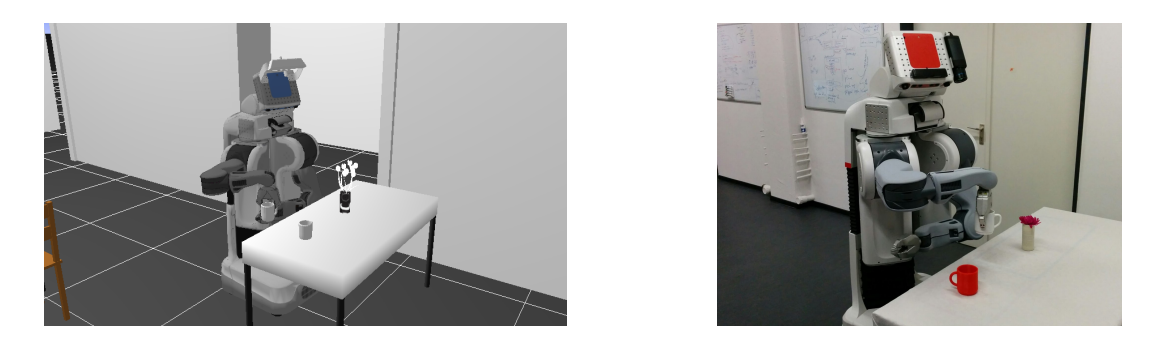
Figure 2: The simulated environment in Gazebo (left), and the corresponding physical laboratory setup (right).

in order to increase its stability. The arms should be in a specific position during driving (arms tucked) to avoid occlusion of sensors and collisions.