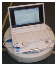
(a) iRobot Create

Our work has focused on off-the-shelf systems that are available for purchase by other research groups. While much of the work in the Brown ROS Package can be used on any platform running ROS, we also provide drivers for two widely-available platforms: the iRobot Create and the Aldebaran Nao (pictured in Figure 1).