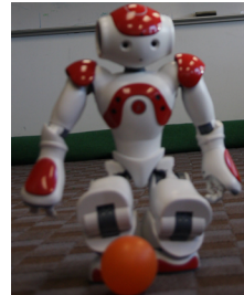
(b) Aldebaran Nao