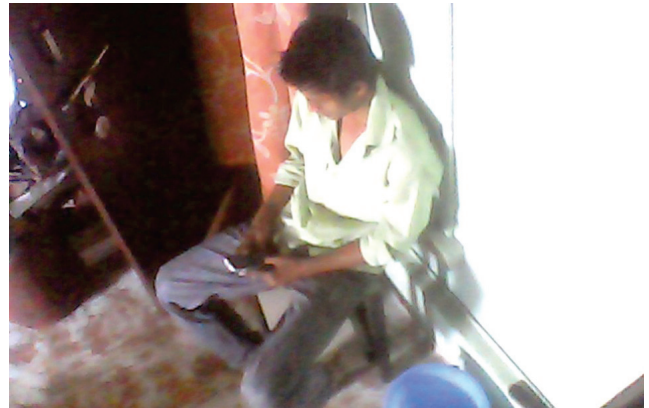
Figure 1: A worker in India completes OCR tasks on his cell phone using MobileWorks.

Copyright © 2011, Association for the Advancement of Artificial Intelligence (www.aaai.org). All rights reserved.