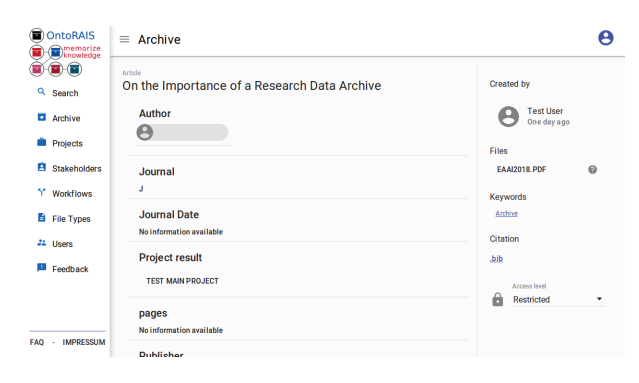
Figure 3: Object View