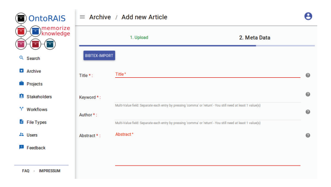
Figure 2: File Ingest