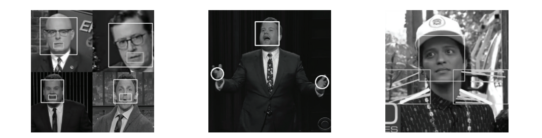
Figure 2: Examples of individual detectors. a) Head and lip detection. b) Hand detection. c) Shoulder detection. The thin light grey lines are candidate shoulders. The thicker white lines are the chosen shoulder lines based on symmetry and color difference.

by looking for similar face positions. Then, if found, we get motion in pixels for both hands. We take the maximum motion for all people on screen and compare it to two thresholds. The lower threshold removes insignificant motion. The upper threshold removes noise (when detections are noisy, they jump around the frame from one place to another). Figure 2 (center) shows an example of hand detection.