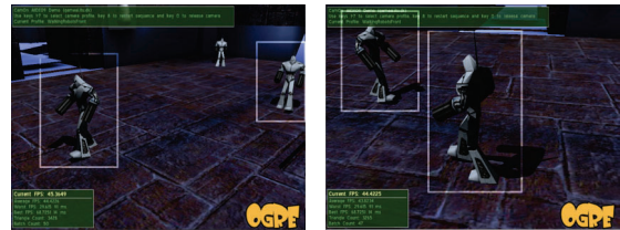
(b) Robots facing same direction (c) Robots facing opposite directions