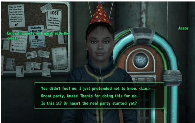
Figure 1: Conversation in Fallout 3 .

has lived his (or her) life in one of those vaults until reaching 19 years of age. After that he escapes the vault and gets confronted with the remains of civilization on the overland.