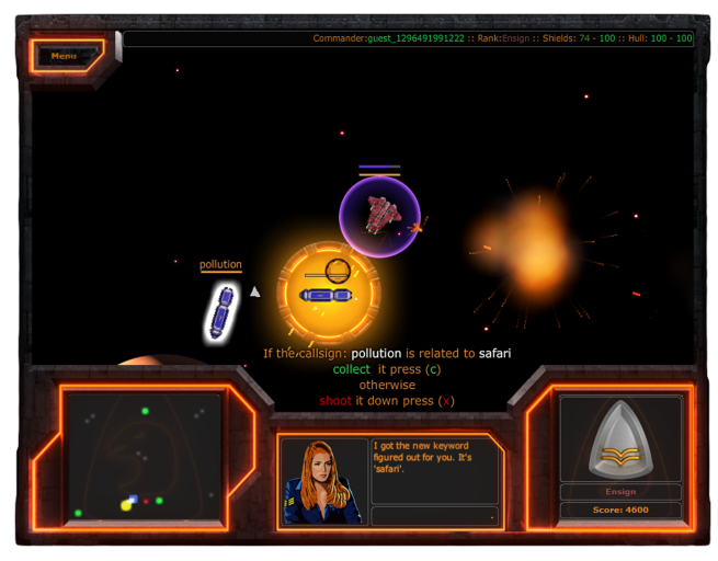
Figure 4: The mission in the lower center tells the player to collect the highlighted vessel if the label "pollution" is related to the term "safari".

mind the term "grass". The game presents two terms from a collection of 1000 words to the player to decide whether these terms have such a relation or not. Therefore a total of one million relations have to be checked. This collection was not preprocessed to collect human judgment for every relation. All possible evocations are presented to players, as there are no other mechanisms involved to exclude certain combinations. The game attracted around 500 players in the first 10 hours of its release. Figure 4 shows a screenshot of this third version of OnToGalaxy .