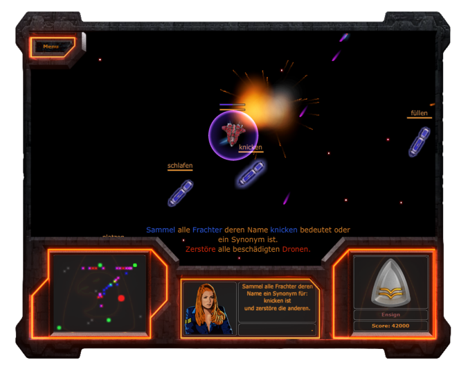
Figure 3: The mission in the lower mid tells the player to collect all freighters (blue ships) with a label being a synonym for "knicken" (to break). The female character on the bottom gives necessary instructions. The player is controlling the red ship in the center of the screen.

25 players classified 360 (not including gold relations) possible synonym relations under lab conditions. The players played 14 hours in total. Each synonym took 2.3 minutes of game play to be verified. Even though the overall precision was high (0.97) the game had a high rate of false positives (0.25). A reason for that can be a misconception in the game design. The number of labels that did not fulfill the relation presented to the player was occasionally very high - up to 9 out of 10. Informal observations of players indicate that this leads to higher error rates then more equal distributions. Uneven distributions of valid and invalid labels were also reported as unpleasant by players. Again informal observations point to a distribution of 1 out of 4 to be acceptable for the players.