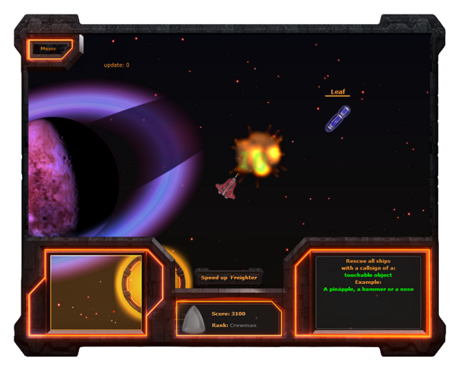
Figure 2: Ontology population version of OnToGalaxy. The blue ship on the right is a labeled freighter. The red ship in the middle is controlled by the player. On the lower right is the mission description. It tells the player to collect freighters labeled with words of "touchable objects" such as "hammer".

mon words of the English language. The test set uses 5 base categories of the DOLCE D18 (Masolo et al., 2001) and a corpus of 2189 common words of the English language. For each category 6 gold relations were marked by hand (3 valid and 3 invalid) to allow the evaluation algorithm to detect unwanted user behavior. The task performed by the player was to associate word A to a certain category C of the DOLCE. For instance the mission description could ask the following question: is "House" a "Physical Object," where "House" is an element of the corpus and "Physical Object" a category of D18.The mission description included the category of DOLCE in this case "Physical Object". The freighters labels were randomly chosen from the corpus of words in this case "House". To test player behavior a set of gold data was generated for each category. A typical mission could be "Collect all freighters with a label that is a (Physical Object)". Figure 2 shows a screenshot of this first version of OnToGalaxy. 32 players played a total amount of 26 hours under lab conditions, classifying 552 words with 1393 votes. Thus, each word required 2.8 minutes of game play to be classified.