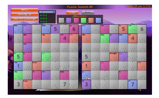
Figure 3: A 7x7 double-board, hidden-cage puzzle from Everyday Genius: SquareLogic . This puzzle is one of 200 found in the game's 23rd location (Summit) of 42 locations included in the PC version.

award-winning puzzle game created by Ken Harward and Squirrel Eiserloh at TrueThought LLC, released for Windows/PC in 2009, and subsequently ported (third-party) to iPad. The game received very positive reviews ("sublime", "a phenomenal game", "hauntingly beautiful", "quite ingenious"), was named Best of 2009 by GameZebo, and has been used in numerous classrooms. Players have logged thousands of hours in the game, making it one of the "stickiest" games on Steam (where the game has currently received 92 positive and 0 negative reviews).