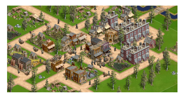
Figure 1: A screen shot of the game 1849.

1849 is a simulation game set during the California Gold Rush, released in May 2014 for PC/Mac computers, and iOS and Android tablets.