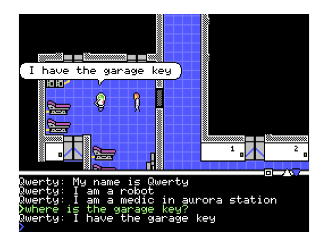
Figure 1: A screenshot of SHRDLU showing the main character talking with an NPC robot named Qwerty.

As shown in Figure 1 the key difference between SHRDLU and Sierra adventure games is that, while in Sierra adventures the player had to type commands to make the main character perform actions (like in earlier Zork-style text-based adventures), in SHRDLU typing is used to talk to other NPCs in a similar way as in Façade game (Mateas and Stern 2003), or MKULTRA (Horswill 2014).