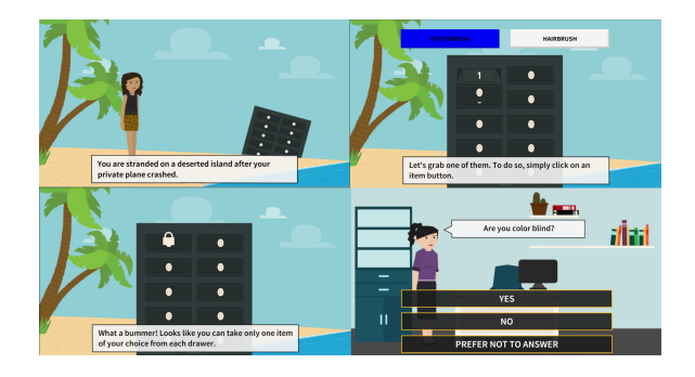
Figure 2: Screenshots from the scenario "Deserted Island: Cabinet Mystery." From top left to bottom right: introducing the player to the situation, selecting an item, the response to selecting the item, and asking a demographics question.

Descriptive statistics reveal that the metrics are mostly not normally distributed in these scenarios, showing mostly positive skew. The only normally-distributed metrics are the average outdegree, text characters per dialogue, and renewal rate. We visualize the normalized box-and-whisker plots in