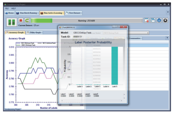
(b) Real-time strategy accuracy and belief over task label.