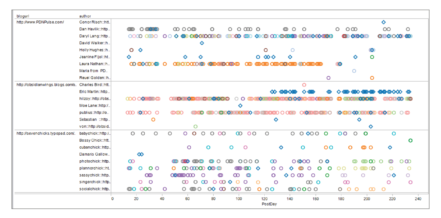
Figure 2: Posting patterns for three sample blogs, showing the authors, the number of posts, and tags assigned to the posts (diamond shape indicates no tags were used, tag text differentiated by color, only one post visible per day).