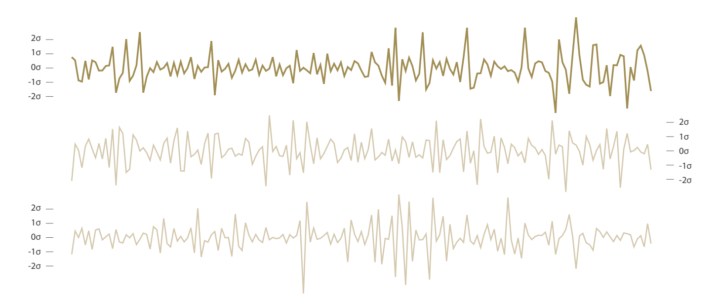
Figure 3. The real Anxiety Index (top) and two doppelgänger Anxiety Indices (bottom) generated during Monte Carlo simulation. Using a kernel density estimate, we generated new Anxiety Indices to experimentally test this paper's main result. Testing for Granger causality with one million new Anxiety Indices confirms the result, but inflates the p -value slightly, from 0.0322 to 0.0453.