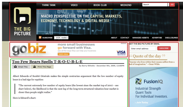
Figure 1: Pagelets Within an Example Webpage.

Copyright © 2010, Association for the Advancement of Artificial Intelligence (www.aaai.org). All rights reserved.