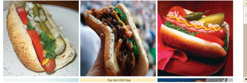
Figure 2: Social Network query results related to diet with additional information from livestrong.com

Some of these foods were found in Danny's Social Networks as shown in the following photos