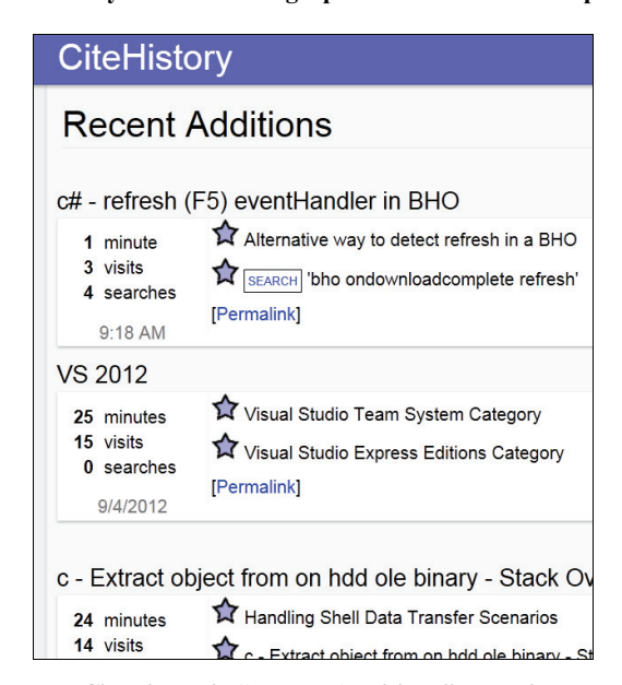
Figure 5. CiteHistory's "Recent Additions" page lists recent bibliographies created by CiteHistory users.