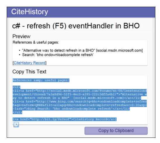
Figure 4. Based on the selected history items, CiteHistory automatically formats bibliographies for inclusion into posts.

A total of 44 people participated in the two-week deployment study of CiteHistory. During this timeframe, we collected usage logs describing the activities of these 44 individuals, and we conducted 13 user interviews to directly observe their use of CiteHistory. In each of these 13 interviews, we asked participants to attempt to answer a Stack Exchange or MSDN forum question. Each interview lasted at most one hour. In 4 cases, participants could not find an unanswered question they felt comfortable answering in this timeframe. In these cases we altered the protocol to allow users to answer questions which had already received accepted replies. In these cases, we asked participants to go through the motions of writing an answer for the purpose of evaluating CiteHistory's features, but not to submit their answer (since submitting answers to alreadyanswered questions is discouraged by forum moderators).