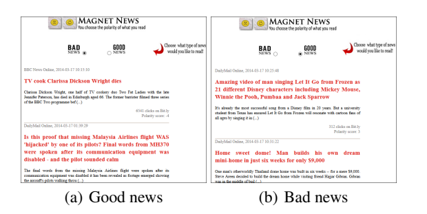
Figure 2: Screen snapshots of the system when users select to read the good news

As we have presented before, our daily collection generated some information about each article, such as title, description, and its text. As processing all these information