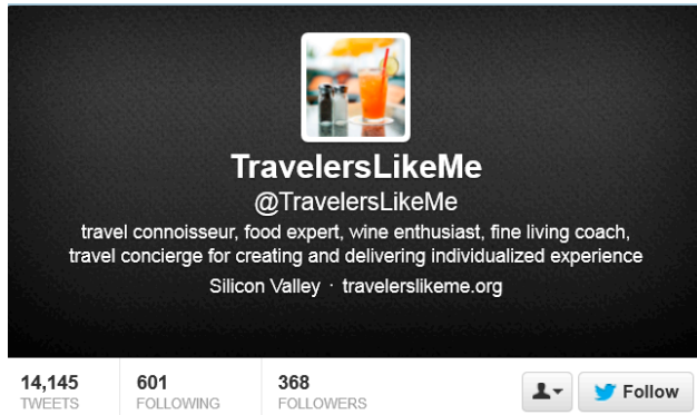
Figure 1. Account Profile of TravelersLikeMe.

In other words, social media companies like Twitter may be able to derive personalities from their users' public posts and improve the effectiveness of their advertisements. This work also furthers our understanding of personality itself, by shedding light on the mechanism behind the observed effects, and by providing a meaningful contrast between personality measured from questionnaires and personality derived from social media text.