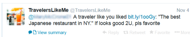
Figure 3. Recommendation from TravelersLikeMe.

Over the course of the field study we targeted 5,917 Twitter users, 2,043 in Phase I and the rest 3,874 were in Phase