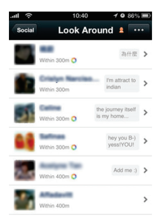
Figure 3: "Look Around" results sorted by distance

Look Around, as shown in Fig. 3, allows a user to find other nearby users who have also used this feature. The results page provides a list of users sorted by geographical distance. The user can choose to send messages to others who can be strangers. When enabling the Look Around feature, the system has access to a user's geographical locations and may present his or her profile in other users' Look Around results pages.