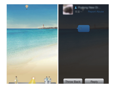
Figure 2: Using "Drift bottle": step 1, pick a bottle; step 2, read/hear the message in the bottle and can reply