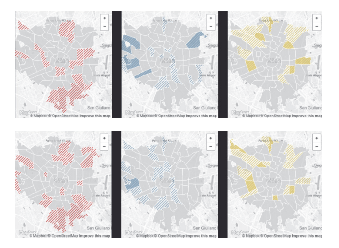
Figure 2. Italian, English and Other language predominance: (a) January 2015 - March 2015; (b)April 2015 - June 2015.

Figure 2 shows the qualitative results of the language analysis, with separated Italian, English and Others contributions for two exemplary quarters, one before the Expo 2015 exhibition and one during the event.