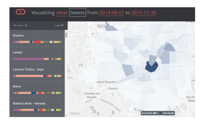
Figure 3 Explore Tweets, Other languages

Spanish tweets represent a consistent percentage of non-Italian and non-English tweets for many NILs (above 20% for most of the NILs), indicating a more spread nature of the Spanish Twitter community within the city of Milan.