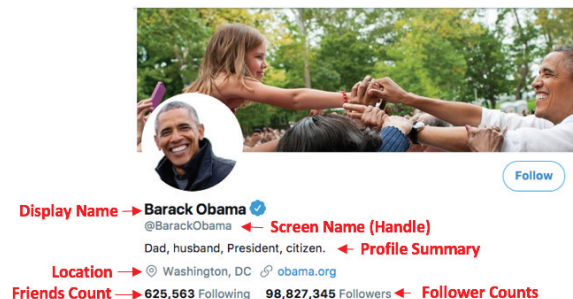
Figure 1: Sample Twitter profile and relevant fields.

To address the problem of representativeness and sample selection bias (Tufekci 2014), we designed a longitudinal study of Twitter profile snapshots. First, using Twitter's