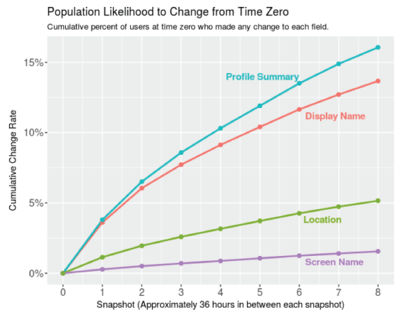
Figure 2: Population Cumulative Likelihood Change Rates

RQ1: For randomly selected, active Twitter accounts, how often do users change their profile information and