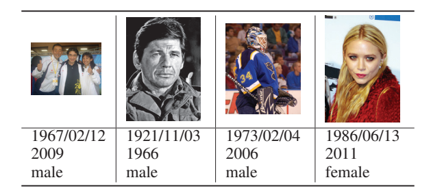
Table 4: Examples from 'IMDb-Wiki' with ground truth.