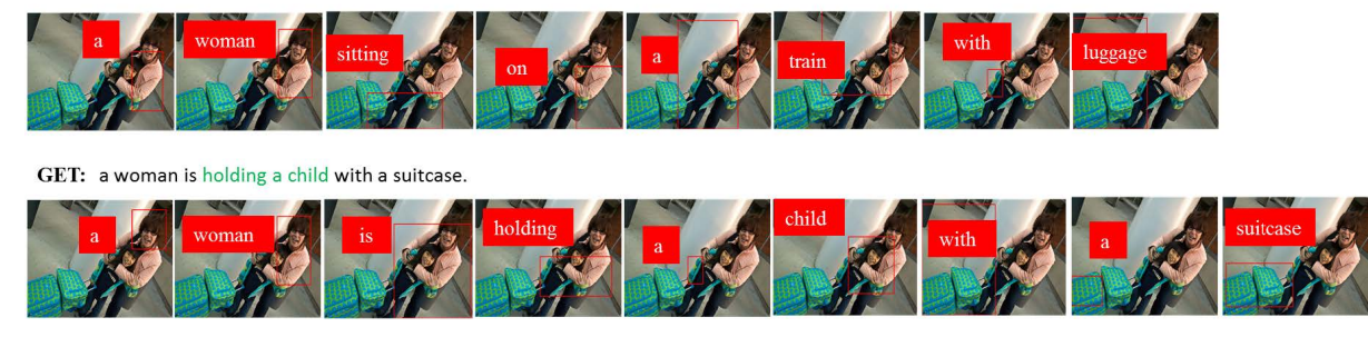
Figure 4: The visualization of attended image regions along with the caption generation process for plain Transformer and the proposed GET. At the decoding step for each word, we outline the image region with the maximum output attribution in red.

Transformer: a woman sitting on a train with luggage.