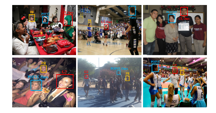
Figure 7: The visualization results of different methods on the Unconstrained-7k Dataset. Above each bounding box, we indicate the methods (PR, POINT, Ours) and ground truth (Ours). The top row shows the samples that our method gets the GTs. The botton row shows the failure cases.

visibility degradation and even sometimes destroy the color or content of the VIPs. (2) VIP with positive regular face is easier to recognize, others are more difficult to recognize. The main reason is that the positive face information is rich and the discrimination information is more. In other condi-