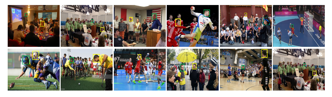
Figure 6: The visualization results of our JSRII-GNN on the Unconstrained-7k dataset. In each image, the yellow bounding box indicates the result that is obtained by JSRII-GNN w/o Individual Interaction. The green bounding box indicates the result that is obtained by JSRII-GNN w/ Individual Interaction (it is also the GT). Due to the assistance of significant objects, JSRII-GNN w/ Individual Interaction shows a better performance.