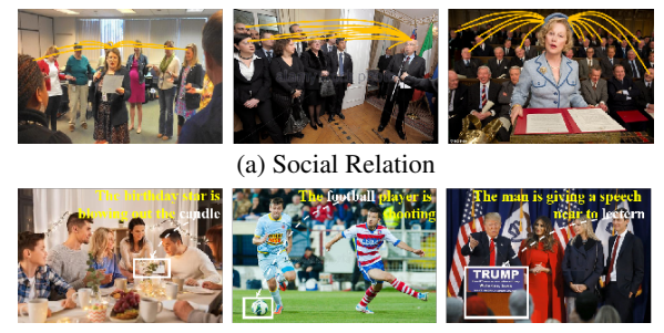
(b) Individual Interaction

Figure 3: (a) Very important persons are often associated with most other persons. We define this factor for VIPLoc as social relationship. (b) Persons have different interactions with the key object. The important person contains a more close interaction in the current event, such as birthday star and cake, speakers and lectern, and player and football in the examples. We define this factor for VIPLoc as individual interaction.