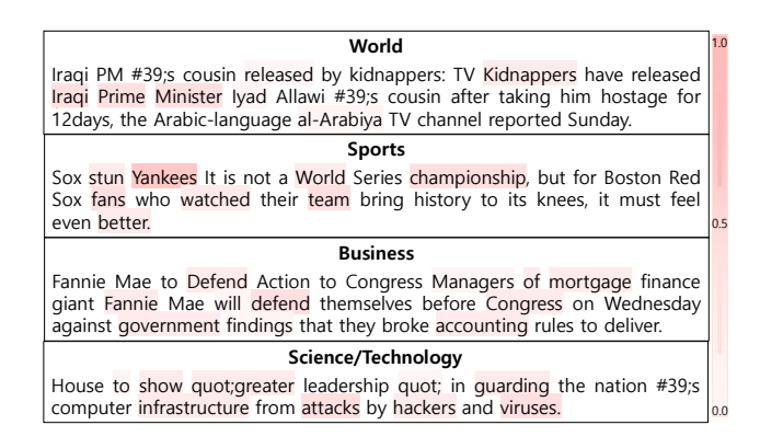
Figure 3: Visualization of the attention score of data predicted by the initially trained classifier with high confidence.

Attention mechanism. Figure 3 visualizes the attention layer of the initially trained attention-based classifier for identifying lexicon in our model: the darker the color, the higher the score. We notice that the initially trained classifier assigns a higher score to important words of the data predicted with high confidence; in other words, the attention mechanism successfully identifies relevant words for text classification using attention scores. This is why the attention mechanism is crucial in our method for effective classification.