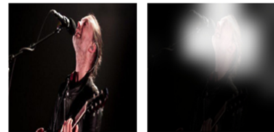
(a) [PER Radiohead] offers old and new at first concert in four years.