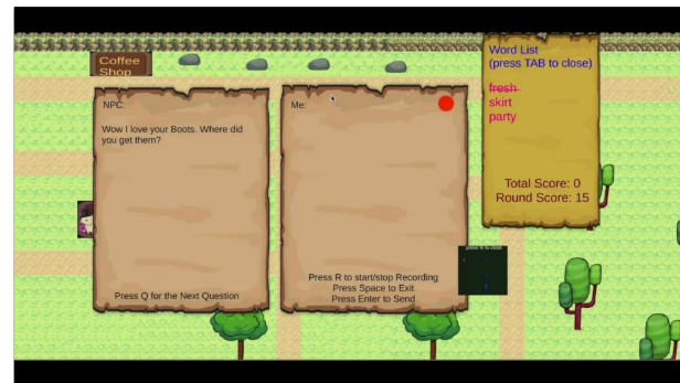
Figure 2: Game interface for MapChat: A game designed leveraging text-to-speech and automatic speech recognition to teach players English

Another DeepMind inspired team explored the research and underlying architecture of the multi-agent system, AlphaStar, in the RTS environment Starcraft II. Specifically, the project aimed to utilize algorithms such as DQN with experience replay, CNN, Q-learning, and behavior tree to model different agents against an AI. The team successfully trained four agents where each agent played 100 games against an easy AI where the win rates were 13, 68, 96, and 59, respectively.