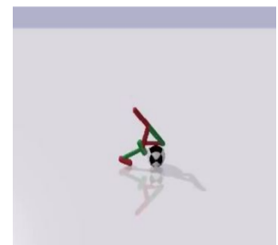
(b) Humanoid Project