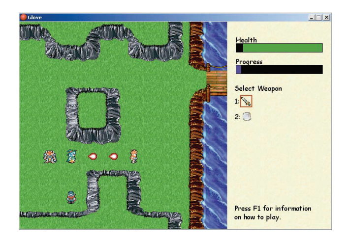
Figure 2: Glove.

Glove has three settings for incongruity: a hard one that makes the player lose after having progressed through about