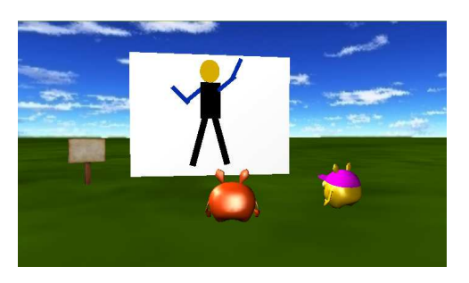
Figure 1: Wubbles playing Wictionary

We are currently working on adding dynamics to the Wictionary game, allowing children to move shapes around on the screen and thus act out scenes over time. We hope this will elicit richer sentences with more complicated syntax, and provide us with a semantic representation of dynamic language.