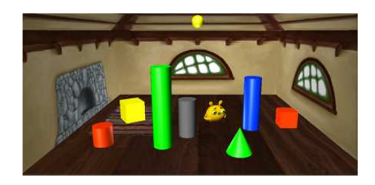
Figure 2: Wubble Room

These criteria are important in a learning method because all word learning in the Blocks Room happens during online interaction with a child. For this purpose, Wubble World offers a series of goal-oriented tasks, such as the construction of a set of stairs to retrieve a hanging golden apple (depicted in Figure 2).