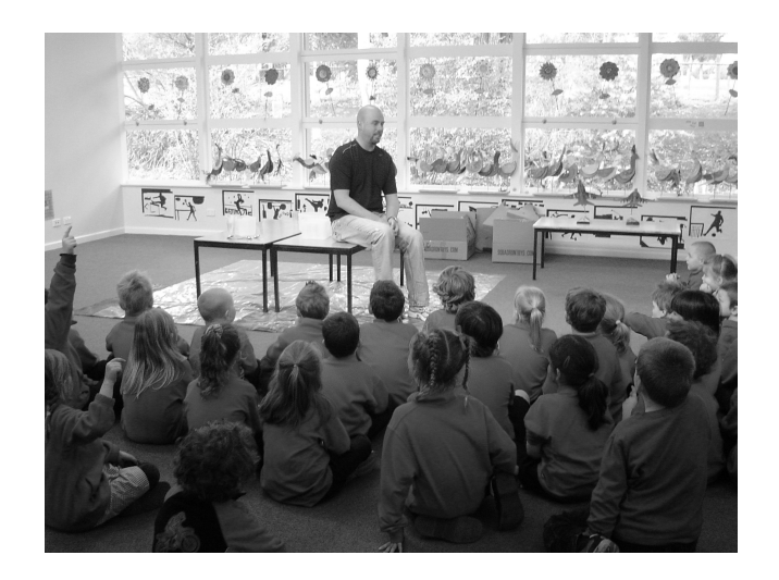
Figure 1: Scientists-in-Schools is a program that partners professional scientists with teachers in an effort to increase educational outcomes in mathematics and the sciences. The type, content, and extent of these partnerships are at the discretion of the scientists and teachers involved and tailored to the needs of the students and the background of the scientist.