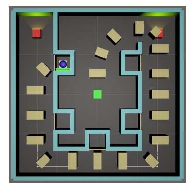
Figure 2: Artificial reward regions in the Hiding Areas level.

In the following subsections we describe the two training methodologies employed on the previously introduced demo game: first a method based on agents trained purely by RL, and then a variant employing RL-execution nodes on hybrid BTs in an attempt to simplify the problem and provide a different family of policies.