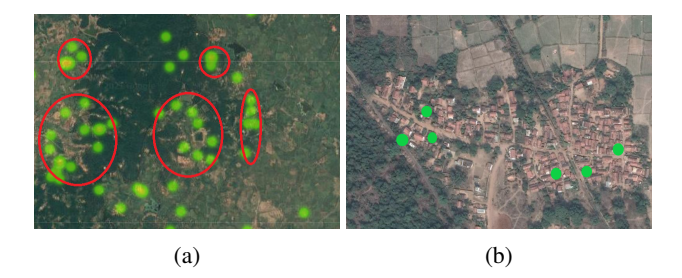
Figure 1: Green dots highlight individual conflicts. (a) Clustered conflicts (highlighted in red) appear near the intersection of terrains. The darker green areas denote dense forested areas, while the lighter areas have sparse vegetation. (b) Conflicts at the boundary of human settlements and forests.