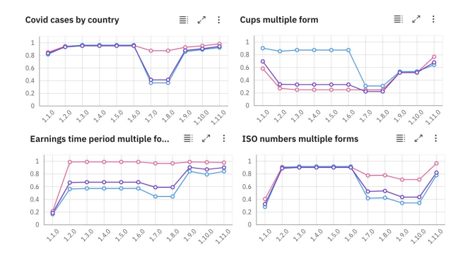
Figure 4: Performance comparison across different backend versions: Average precision (pink), recall (blue), and F1 (purple) over 100 runs each seeded with 6 positive examples.

ing learned. After implementing a fix, the performance of the system improves with increasing number of examples, as verified by the comparison view shown in Figure 3 (7)).