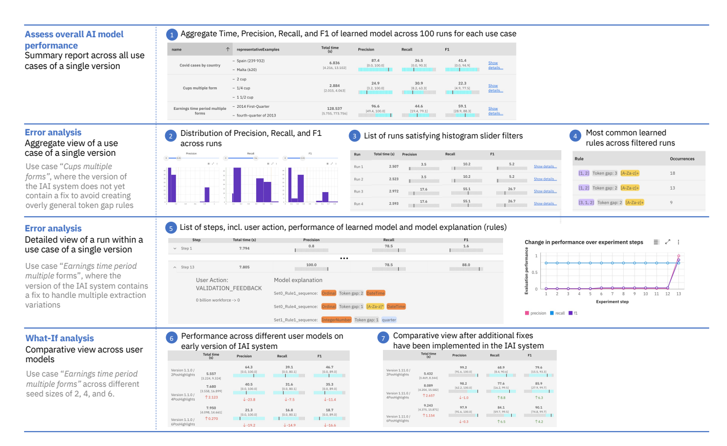
Figure 3: Illustration of InteractEva's core frontend features

The resulting aggregate rule view shows that across low scoring runs the most commonly learned rules contain token gaps (which act as wildcards) (Figure 3 (4)). Such rules are generic and lead to many incorrect extractions. Based on this insight, the development team introduces optional regular expressions into the learner to prevent such over-generalizations. As a result of the fix, instead of generating the generic rule [1,2] Token gap: 3) [A-Za-z]+, Pattern Induction now generates the more specific rule [IntegerNumber] [0-9]* [/]* [0-9]* [A-Za-z]+, leading to better performance on both this use case and beyond.