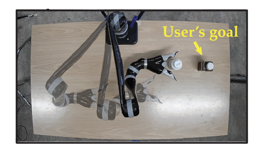
Figure 1: Example failure scenario in shared autonomy.